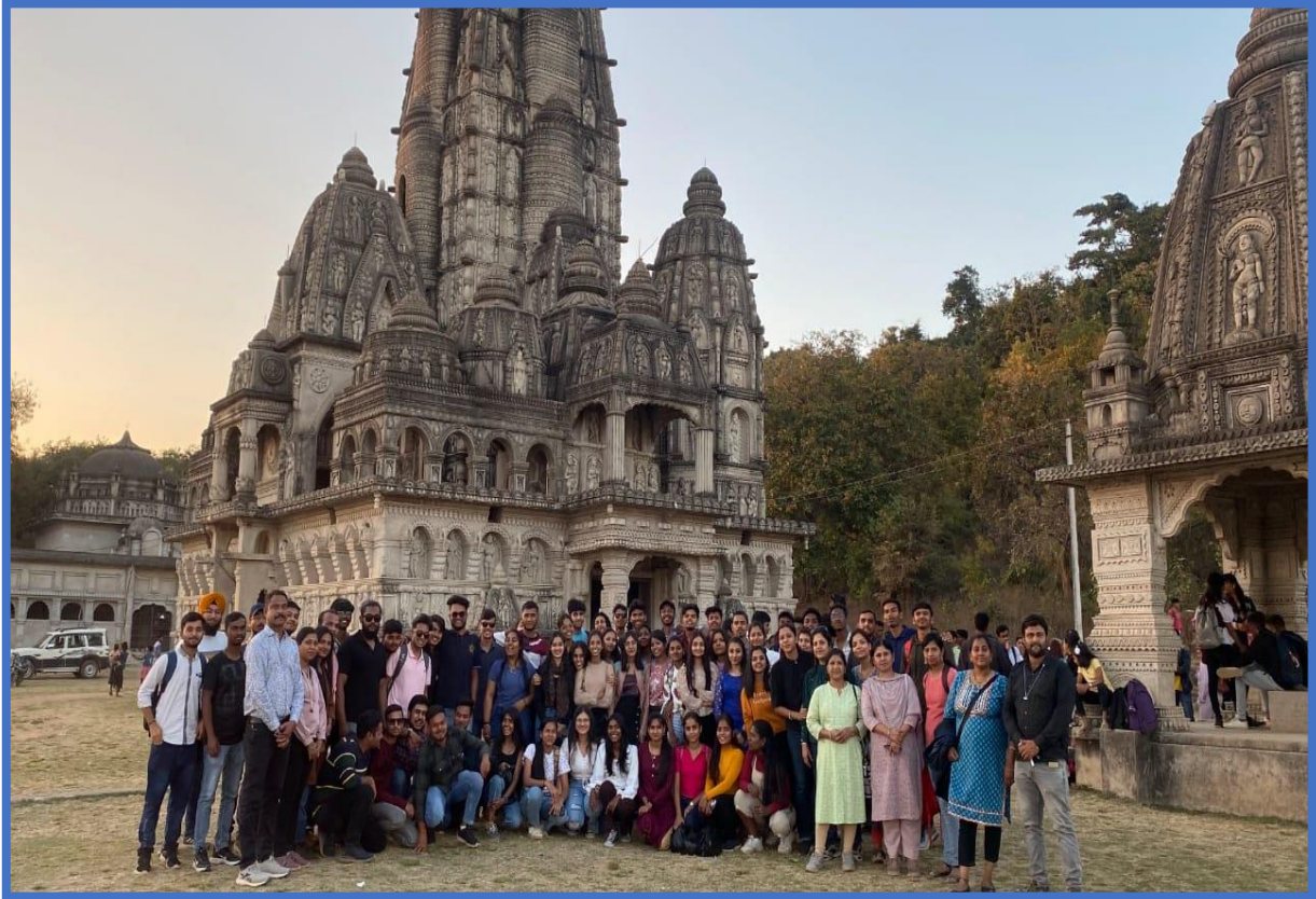
Picture 7-St. Vincent Pallotti Students participating in the ‘Educational Picnic’