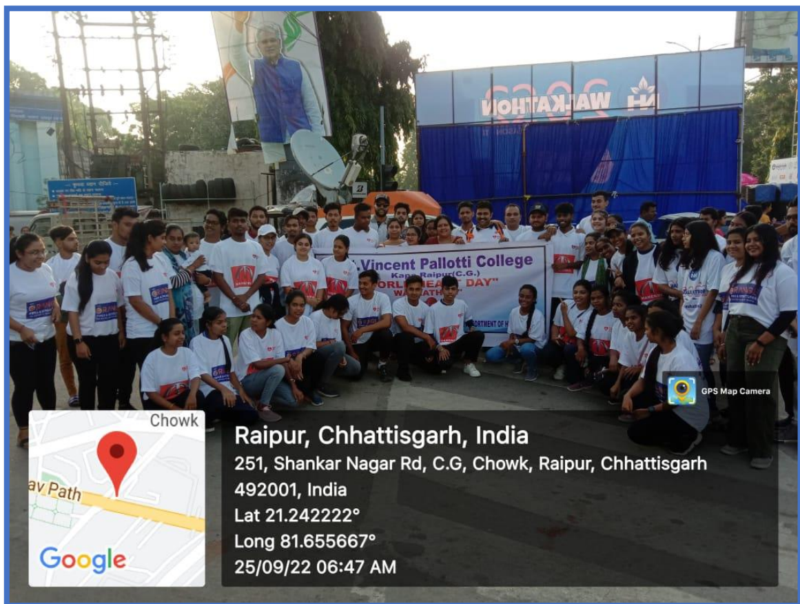
Picture 4-Students' Participation in 'World Heart Day Run' - 25-09-2022