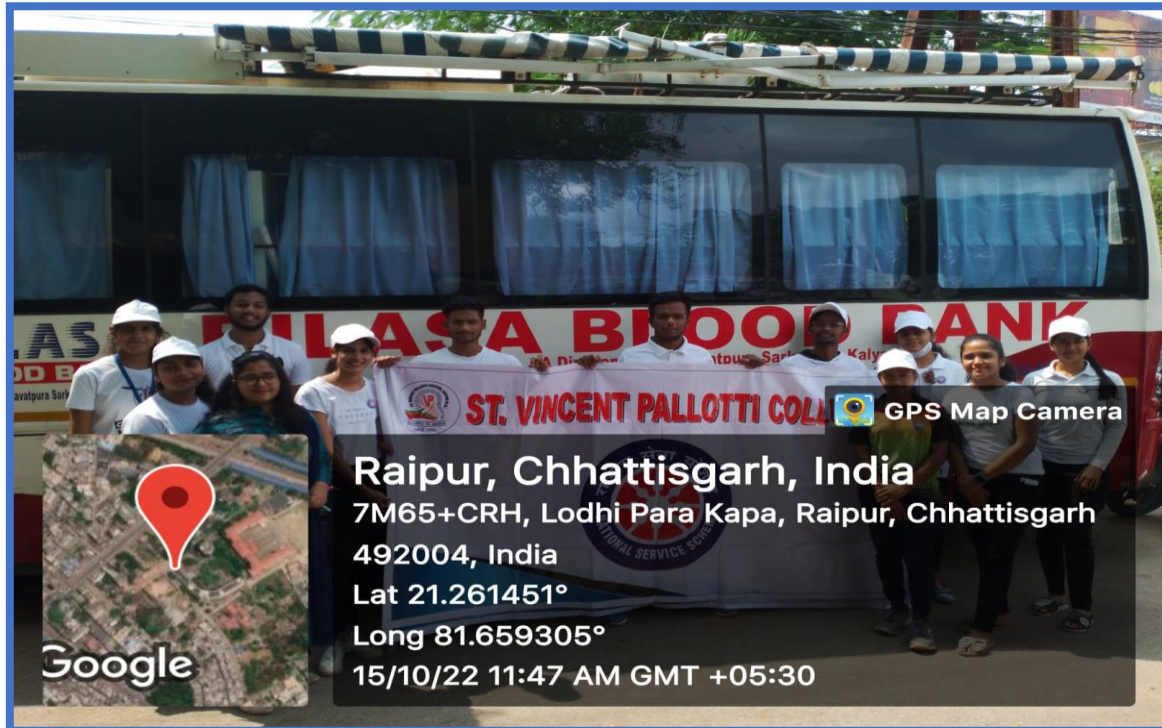
Picture 1-NCC Students participating in Blood Donation Camp 15-10-2022

5.3.2. Institution facilitates students' representation and engagement in various administrative, co-curricular and extracurricular activities (student council/ students' representation on various bodies as per established processes and norms) during the year 2022-23