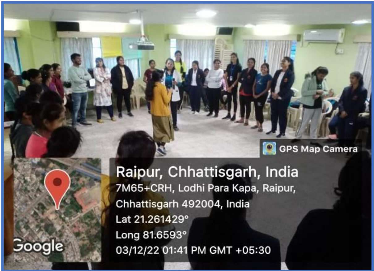
Picture 5-Students participation in the 'Stress Management Technique' on 3-12-2022