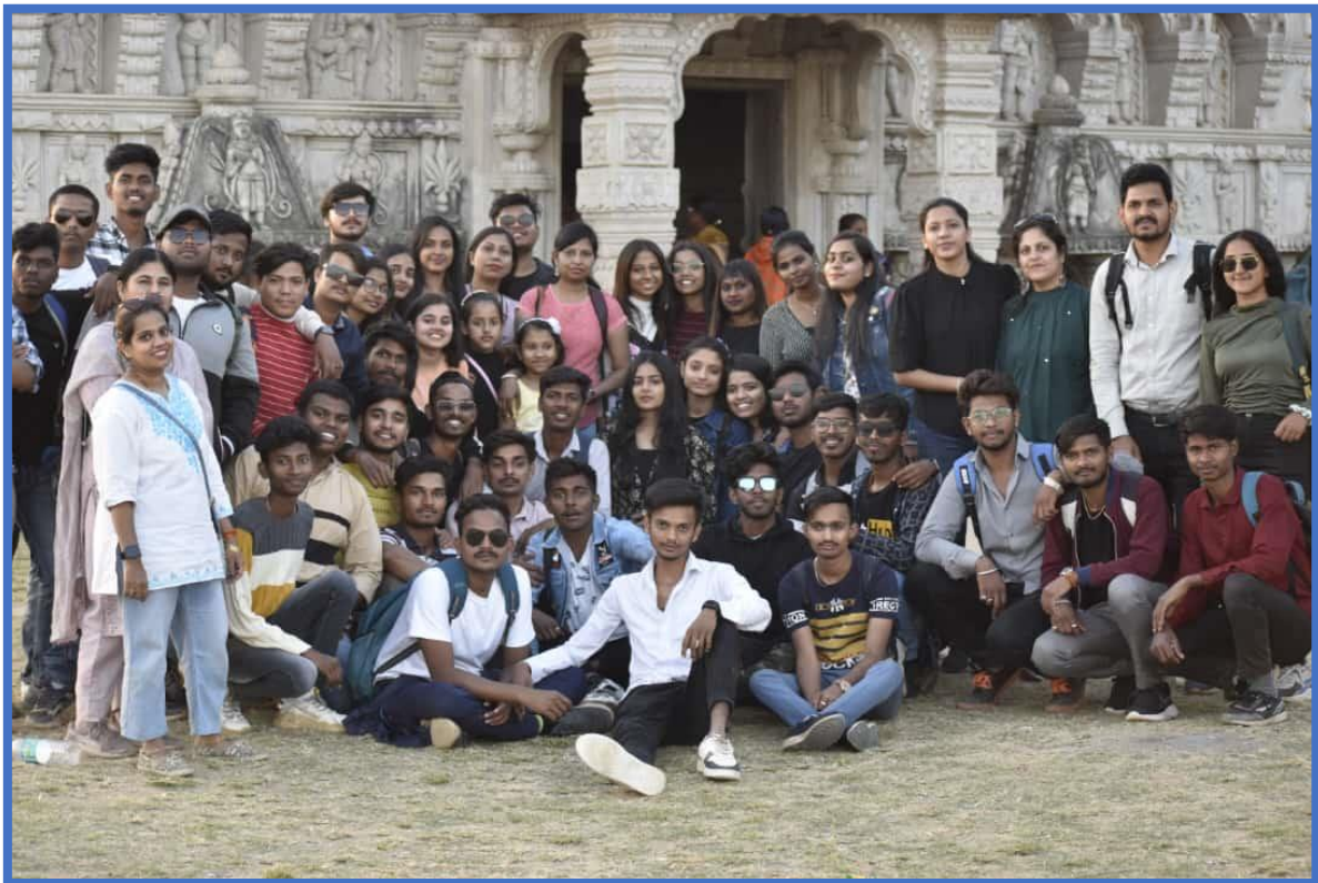
Picture 8-St. Vincent Pallotti Students participating in the ‘Educational Picnic’