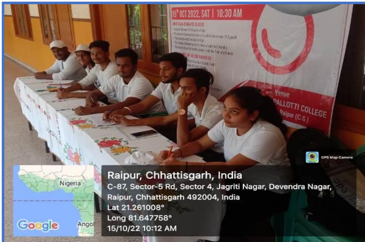
Picture 2-NCC Students participating in Blood Donation Camp 15-10-2022